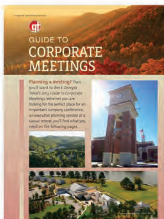
March: Corporate Meetings